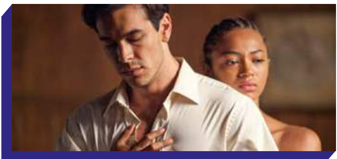
Palm Trees In The Snow. (Fernando González Molina, 2015)

Hollywood adapted Hermann Melville's literary classic, scripted by Ray Bradbury and John Huston, and starring Gregory Peck as Captain Ahab. It was the highest grossing film in the US. Considered one of the hundred greatest films in the history of cinema.