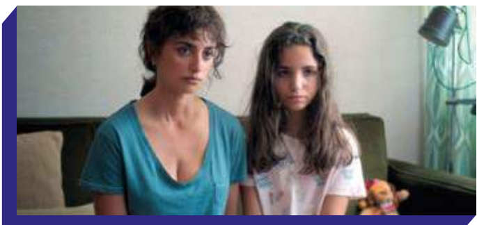
Wasp Network. (Óliver Assayas, 2019)