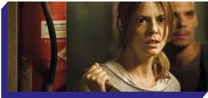
REC 4: Apocalypse. (Jaume Balagueró, 2014)