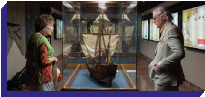
Wild Oats. (Andy Tennant, 2016)

Thriller about a bank robbery starring Raúl Arévalo, José Coronado and Raúl de la Serna. One of the highest-grossing films of 2016. Las Palmas became the Spanish city of Valencia.