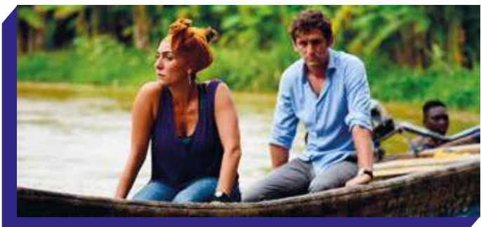
Black Beach. (Esteban Crespo, 2019)

The first documentary from Las Palmas de Gran Canaria with distribution in cinema theatres, which won the Critics' Prize at the 17th International Documentary Film Festival of Uruguay and an Honourable Mention at the 40th Bogotá Film Festival, deals with the confluences between the film director Luis Buñuel and the Gran Canarian writer Benito Pérez Galdós.