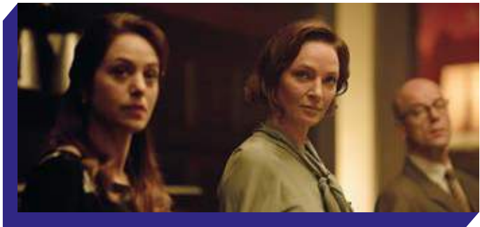
Blackwood. (Rodrigo Cortés, 2018)

Nominated for six Goya Awards, in this thriller a Spanish top executive mediate the kidnapping of an engineer in Africa. It stars Raúl Arévalo, Candela Peña and Paulina García. Las Palmas pretends to be an imaginary capital town south of the Sahara.