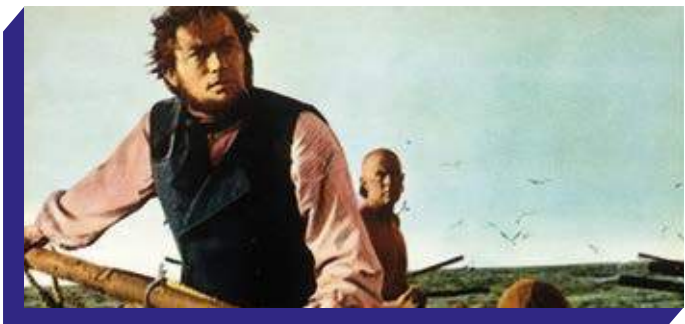
Moby Dick. (John Huston, 1956)