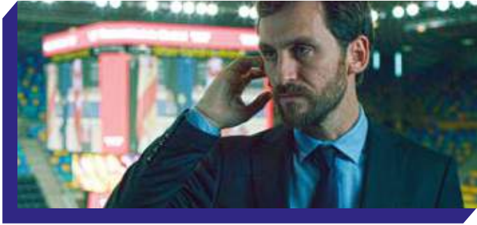
To Steal From A Thief. (Daniel Calparsoro, 2016)