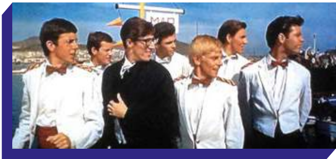
Wonderful Life. (Sidney J. Furie, 1964)

Summer comedy starring Pablo Chiapella and Fran Perea about a group of friends who travel to Río de Janeiro to pick up the body of one of their mates who died in strange circumstances. The city of Las Palmas recreates Madrid and Río de Janeiro.