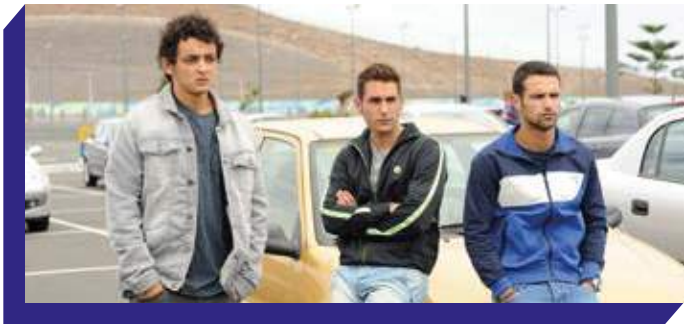
El Niño. (Daniel Monzón, 2014)

Horror film starring Macarena Gómez and Manolo Solo about three siblings who move to a small town with their mother. They soon discover that several children have mysteriously disappeared there.